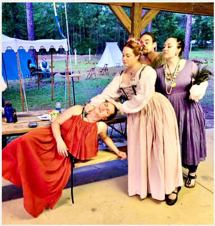
Art comes to life in this shot: Posing as Caravaggio's Judith (Justina) Beheading Holofernes (Una) at Artsy Crown 2023