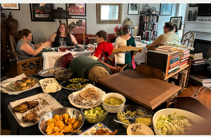
Great food and conversation at Supper Club