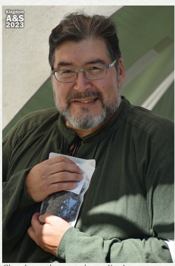
Chocolate and espresso beans, Yum!

I generally like chatting about things connected to Coffee (drinking, brewing, grading, and pairing with) Food (Making, tasting, culture behind the meal) swordplay (mostly rapier and side sword), Coffee, cigars and playing "What 3 people would you like to meet in History...and why?" I'm kinda all over the place in interests.