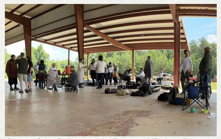
Some of the fighters at the Regional Fighter Practice in Carrollton the Sunday after RUM 2023