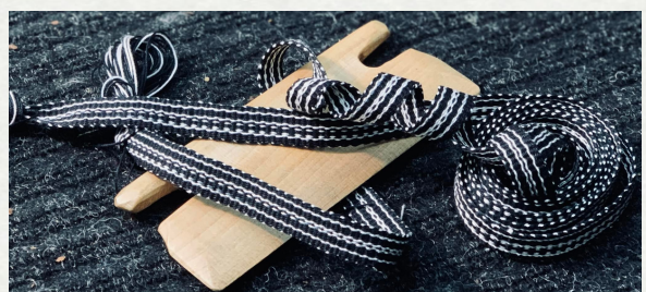
One of my inkle woven pieces