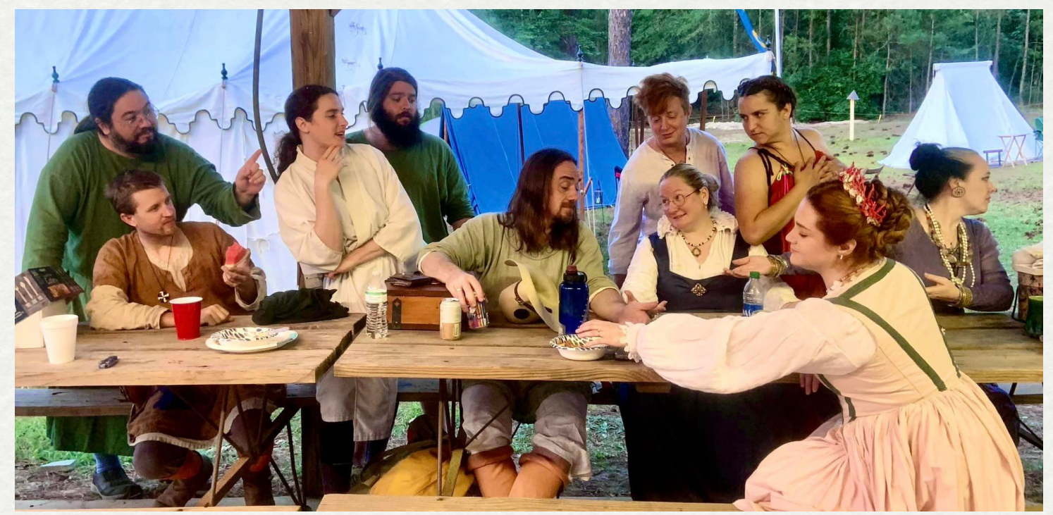
Some populace members recreating da Vinci's The Last Supper in South Downs camp at Artsy Crown 2023