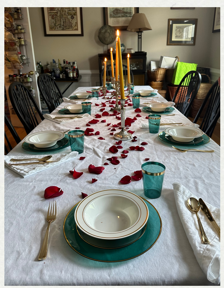
Restarting South Downs Supper Club with style!