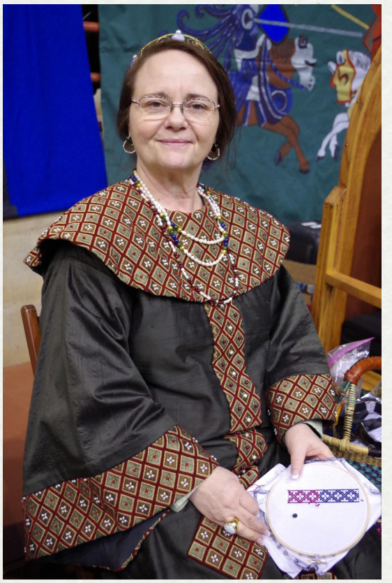
At Meridian 40th Year doing what I love

The Society's caring and giving nature. Whether personal or Kingdom level crisis we are there for each other. We are chosen family. That and really cool historical stuff.